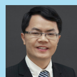
Dr. Yang Feng

Outline: This course offers a comprehensive introduction to the statistical foundations underpinning the prevalent machine learning technique: transfer learning. We delve into how transfer learning effectively transfers knowledge from one task to another in an adaptive and robust fashion, thereby enhancing model performance across both supervised and unsupervised learning frameworks.