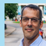
Dr. Eric Kolaczyk

Outline: A gentle introduction to the statistical analysis of network data, largely through the lens of the R package igraph. Topics to be covered include basic definitions and concepts in networks, manipulation and visualization of network data, and tools for describing network characteristics, as well as a brief look at select inferential topics such as node clustering (aka 'community detection') and network modeling.