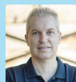
Dr. Marc G. Genton

Outline: The course content will cover the basic concepts of large-scale spatial statistics on parallel systems through synthetic and real data examples using both exact and approximation methods. The course will also provide a comprehensive comparison between existing Geostatistics packages (fields and GeoR) with the cutting-edge HPC packages (ExaGeoStatR and MPCR) to show the main contribution and benefits of using HPC techniques on leading-edge parallel hardware architectures such as GPUs and supercomputers.