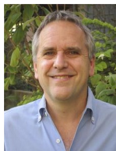
Keynote Speaker Michael I. Jordan, PhD Professor, University of California, Berkeley