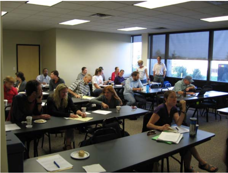
Anxiously awaiting the beginning of the meeting.