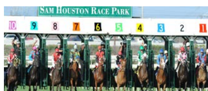
Sam Houston Race Park