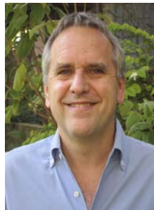
Keynote Speaker Michael I. Jordan, PhD Professor, University of California, Berkeley